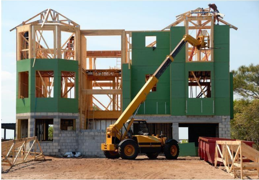
Real Estate Investments