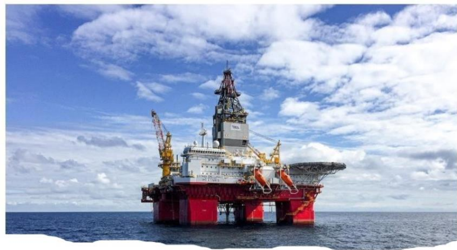
Oil and Gas